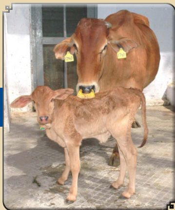
India's first OPU-IVF cattle calf 'HOLI'