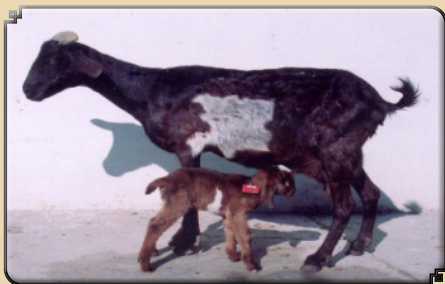
India's first IVF goat kid

All correspondence should be addressed to