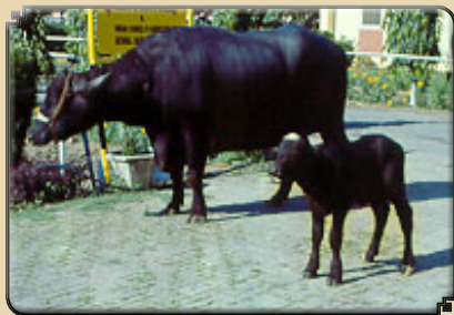
World 's first IVF buffalo calf 'PRATHAM'